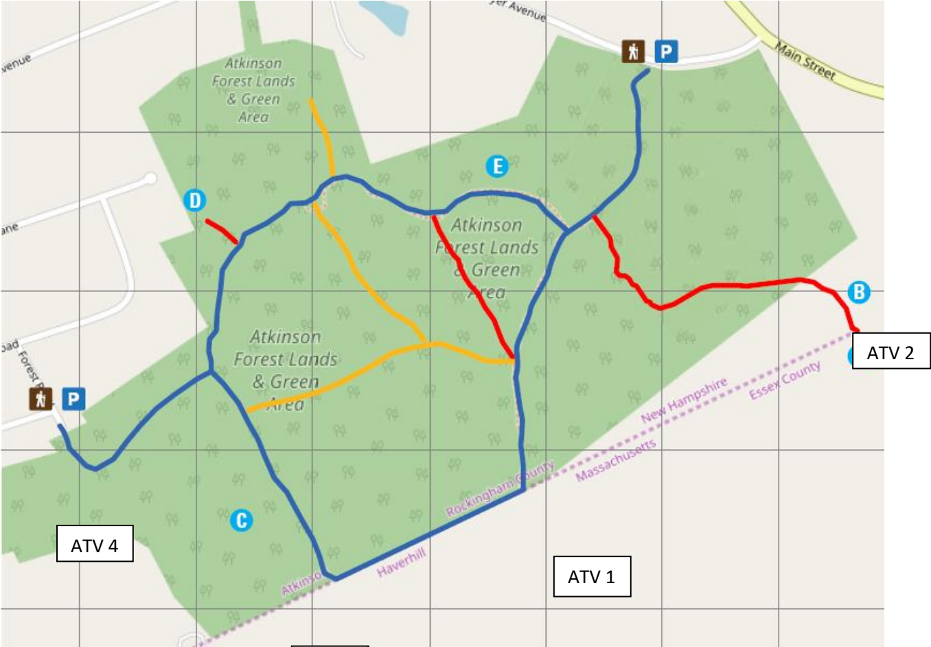
Figure 1. ACL Sawyer Trail Map